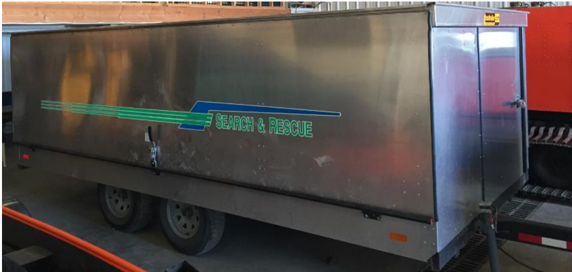
Side 1 of Equipment Trailer, picture 1