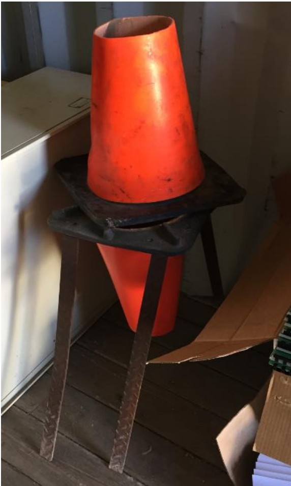
Sandbag Cones inside Conex (Picture 2)