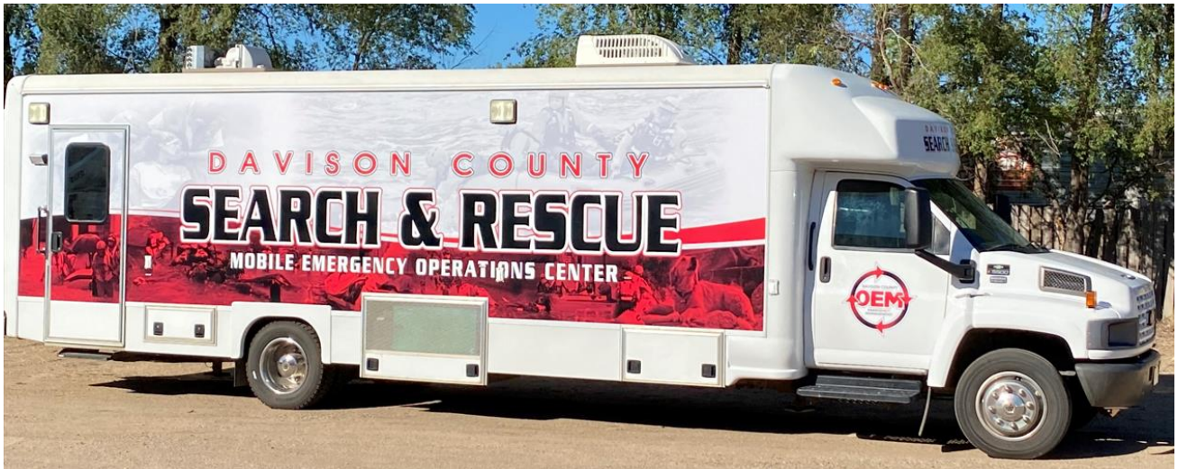
Main Communication Area